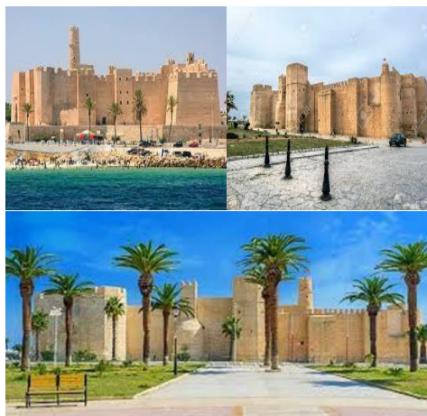
Figure 1: Views of Monastir

7. References in the text should be indicated using numbers in brackets [1]. The list of references follows the last line of the text with one extra line inserted. Follow the Style of the American Institute of Physics [1].